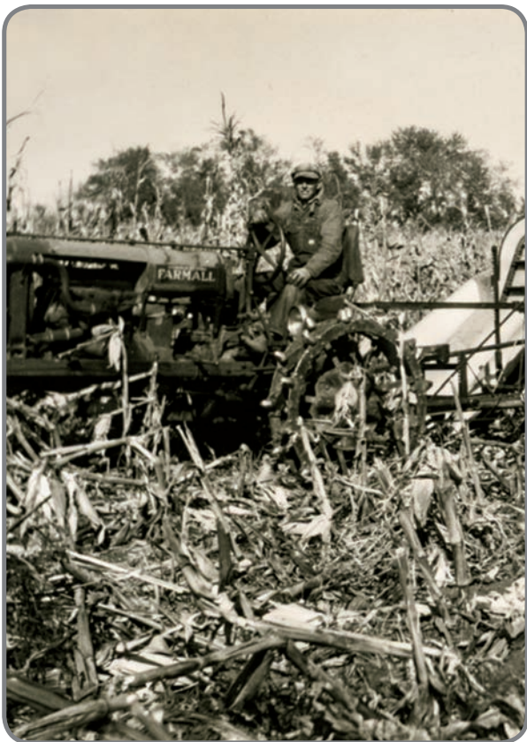
F 20 Farmall tractor.

manually. When cultivating row crops with horses, there were two foot pedals to move the cultivator, left or right, to center the cultivator over the plants. The equipment yard at Pablo's house was littered with a lot of horse drawn cultivators, planters, etcetera.