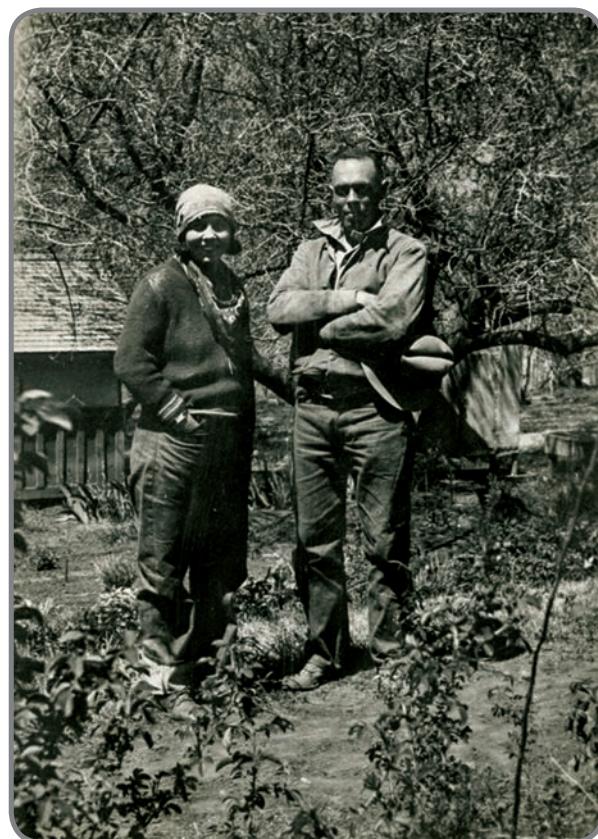
Dad and Mom standing in a field of young cotton plants.

Chicken feed was sold in cotton woven sacks that came with different designs, colors and patterns. After the sacks were empty, they were washed and the material was used to make aprons, curtains, dresses called "feed sack